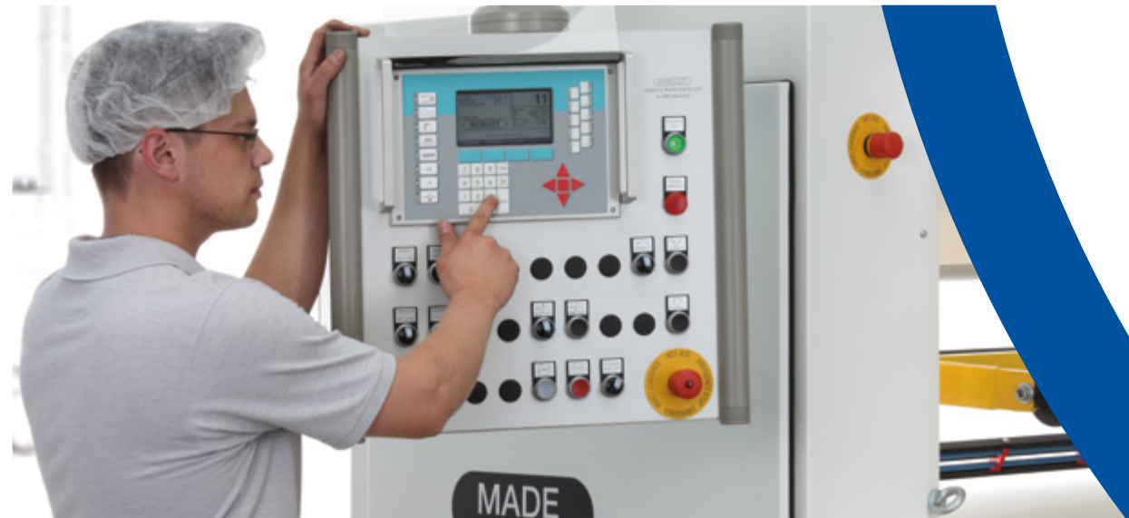
All of the necessary parameters for your product can be stored. Therefore, due to the numerous configuration possibilities, the machine can be tailored to meet the specific needs of your product.